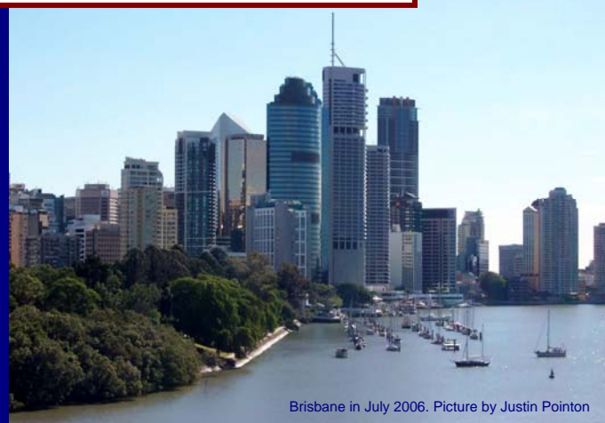
Brisbane in July 2006.

This workshop costs $330.00 (Including GST). A cheque or money order (including GST) made to The University of Queensland must accompany this application form unless prior arrangement has been made with the HIV & HCV Education Projects, School of Medicine, The University of Queensland. Please make contact for alternate methods of payment.