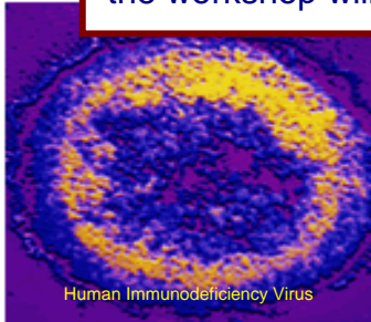
Human Immunodeficiency Virus

This workshop has been designed to provide information specific to the countries in which participants will be working. Opportunity is provided for participants to meet others planning to work in the same country and individuals with expertise in HIV in that country.